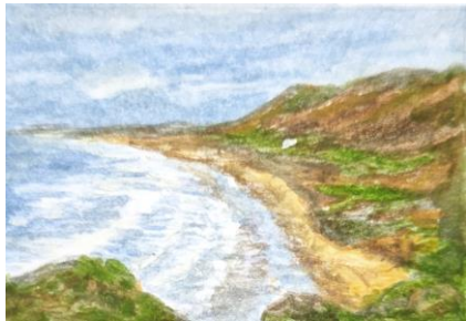
Water Colour: 1.50in x 2.25in