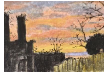
Water Colour: 1.50in x 2.25in

It is a pleasure to wake up to the view of a colourful dawn through our living room windows. This does not happen very often. So, it is such a delight to see the golden light and sometimes pinkish or reddish clouds in the sky.