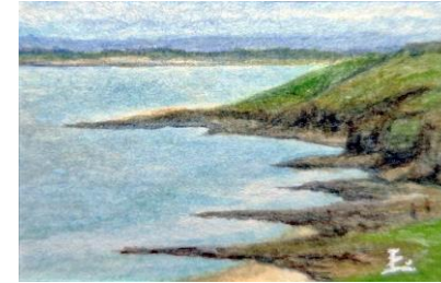
Water Colour: 1.50in x 2.25 in