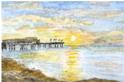
Water Colour: 1.50in x 2.25in