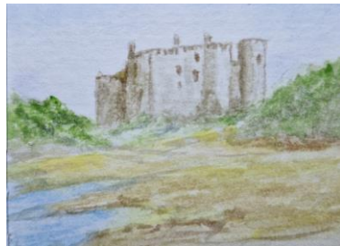
Water Colour: 1.50in x 2.00in