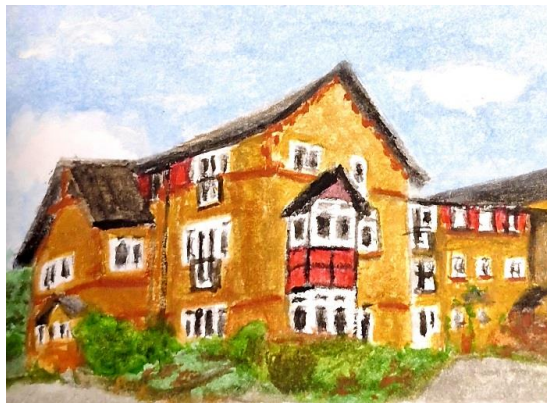
Water Colour: 2.0in x 2.75in