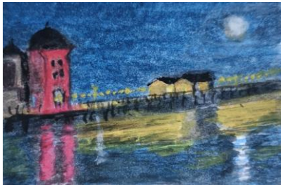
Water Colour: 1.50in x 2.25in