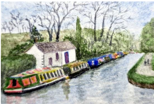
Water Colour: 2.0in x 2.75in