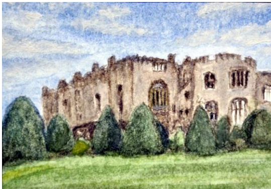
Water Colour: 2.00in x 2.75in