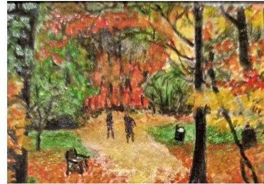
Water Colour 2.00in x 2.75in

Our favourite is Cefn Onn Park, a nature wonderland in autumn. And in spring, it is filled with the scents of Rhododendrons and azaleas.