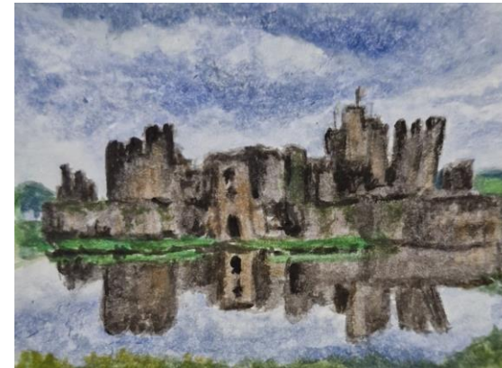
Water Colour: 2in x 2.75in