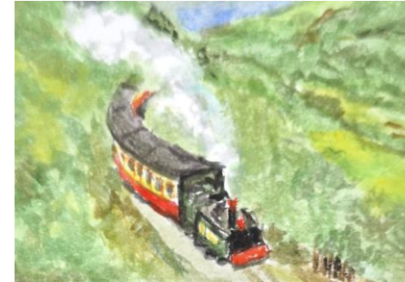
Water Colour: 1.50in x 2.25in

We also must thank Transport for Wales for our rail journeys to different parts of the country. Memories of the gorgeous scenic journeys on the Cambrian Coast Line to Aberystwyth and the Heart of the Wales Line from Llandrindod Wells to Swansea will stay with us for a long time.