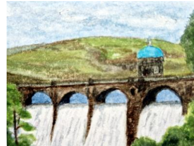
Water Colour: 1.50 in x 2.00in

We took the opportunity to visit Elan when attending a Morgan Club anniversary dinner at Llandrindod Wells.