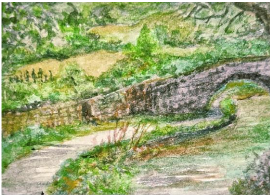
Water Colour: 2.0in x 2.75in