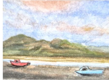
Water Colour: 1.50in 2.25in